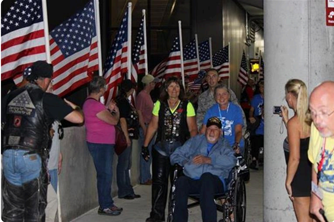
Returning from The Utah Honor Flight 2014